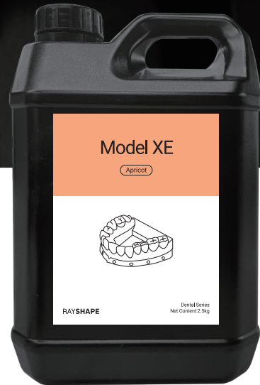
● Apricot Net Weight: 2.5 kg