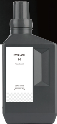
● Translucent Net Weight: 1 kg